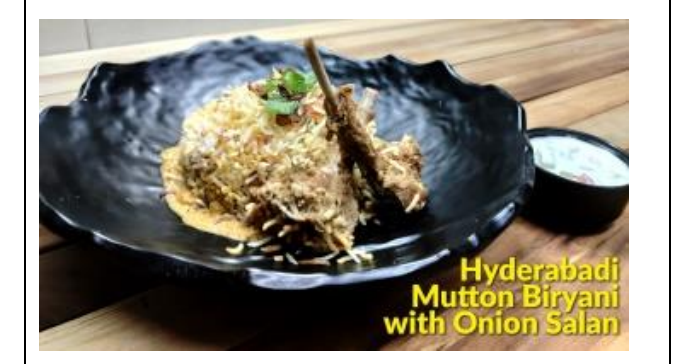
Hyderabadi Mutton Biryani made by SIHM-Faridabad student