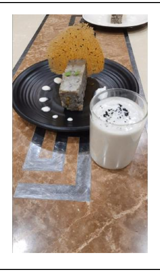
Haryanvi Delight by SIHM-Panipat student