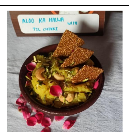
Aloo ka Halwa made by IHM-Hyderabad Student.