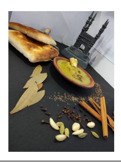
Hyderabadi mutton paya with char koni Naan made by IHM-Hyderabad Student