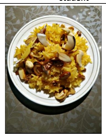
Meetha Chawal made by SIHM-Faridabad student