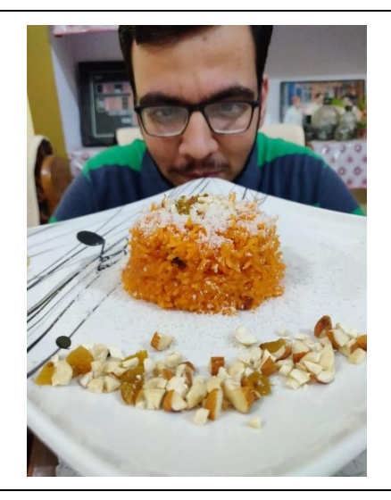
Meetha Chawal made by IHM-Hyderabad Student.