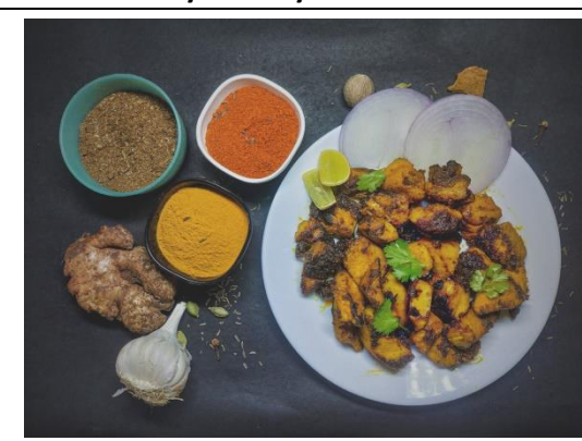
Telangana Kaaram Kodi made by IHM-Hyderabad Student.