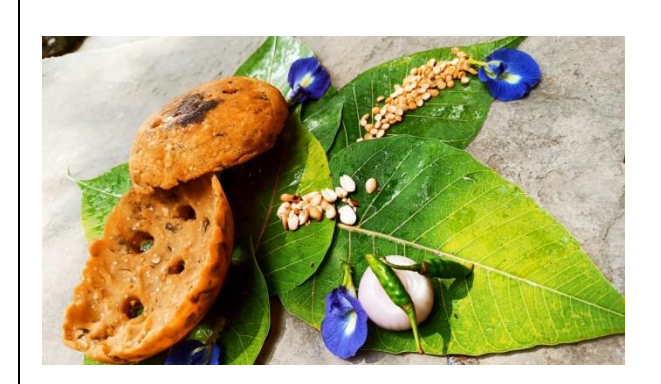
Sarva Pindi made by IHM-Hyderabad Student.