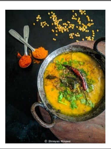
Dal Tadka, Dhaba Style made by IHM-Hyderabad Student.