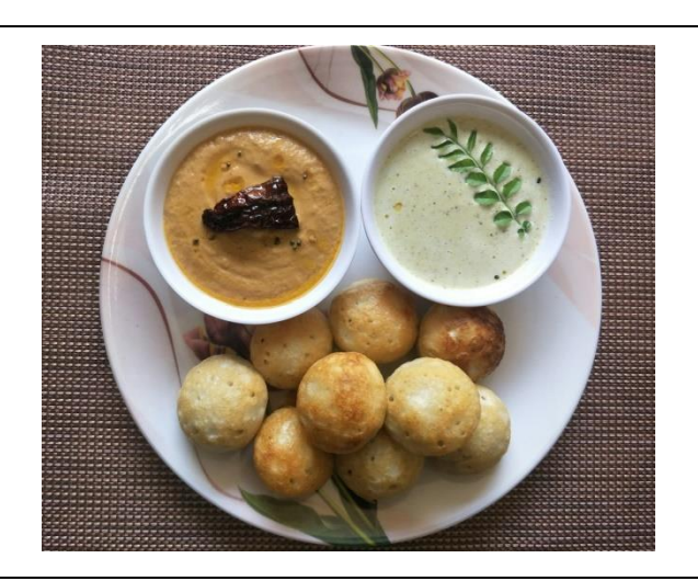
Gunta Ponganalu made by IHM-Hyderabad Student.