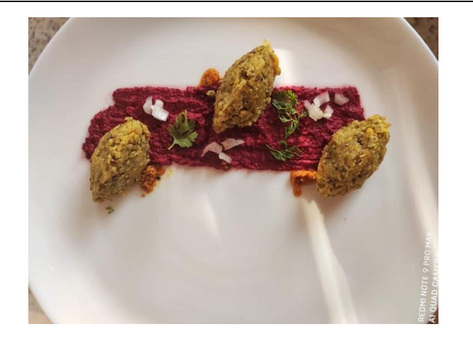
Bajra khichdi with Beetroot pesto made by IHM-Hyderabad Student.