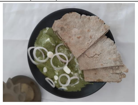
Saag Ka Murg made by IHM-Hyderabad Student.