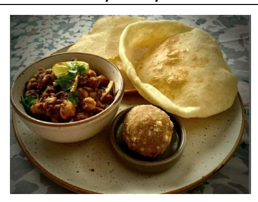
Chole Bhature and Gondh kay ladoo made by IHM-Hyderabad Student.