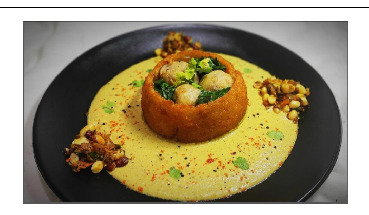
Tomato Rice with Bagara Gravy made by IHM-Hyderabad Student.