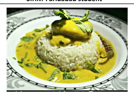
Haryanvi Kadhi Pakoda made by SIHM-Faridabad student